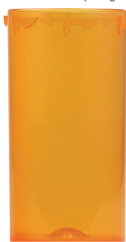
L-13A Inside diameter of opening: 1 1/4"