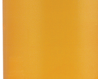
L-60 Inside diameter of opening: 1 7/8"