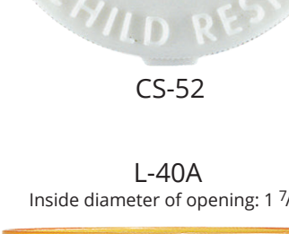
L-40A Inside diameter of opening: 1 7/8"