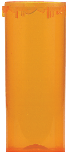
L-8 Inside diameter of opening: 1"